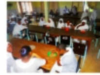
Mamburi Secondary Dinning Hall